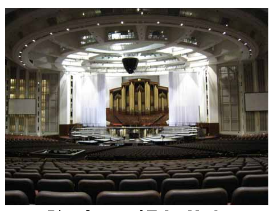
Pipe Organ of TaberNacle

Temple Square building is very beautiful.