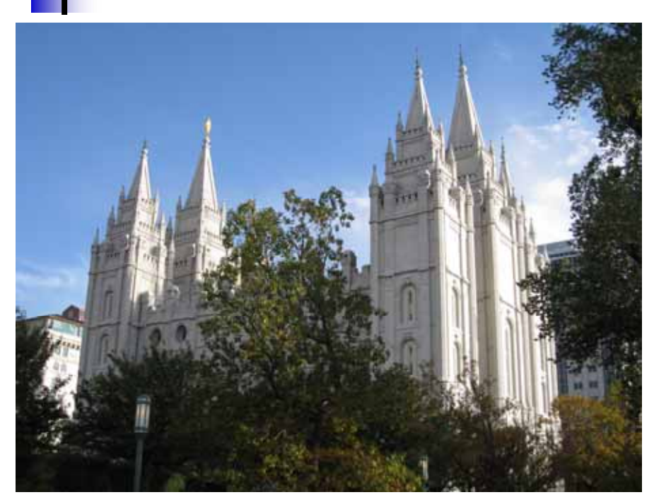
Salt Lake Temple