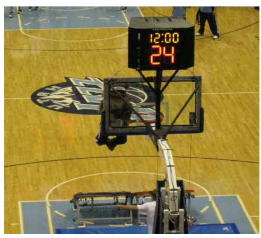
UTAH JAZZ vs Portland Trailblazers