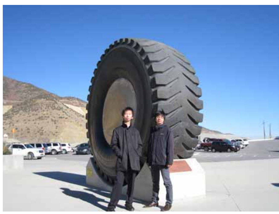
Bingham Canyon Mine