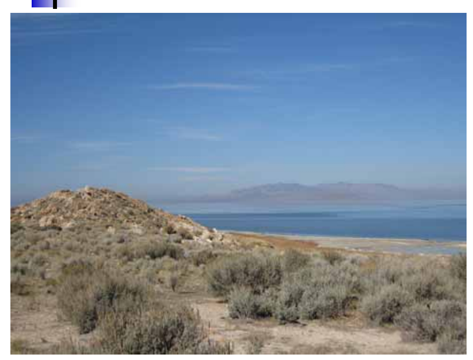
Great Salt Lake

Great Salt Lake is very large, and very beautiful.